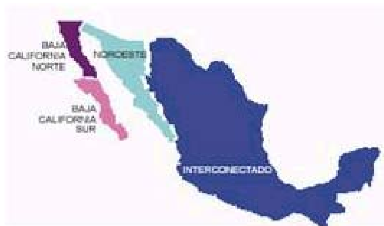
Figure 1: National Electrical Power System divided into systems

The interconnected system allows satisfaction of user demands through collective contributions by each region and, in principle, each power generating station that is part of the system contributes proportionately to each user's consumption. In this manner, it does not matter where geographically the user is located within the system, since all of the generating stations have the possibility of supplying any user. Annex 7 presents emission factors for estimating GHG inventories resulting from the purchase of electrical power.